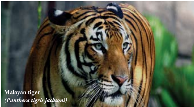
Malayan tiger ( Panthera tigris jacksoni )

GSSP is a forested area, totaling 21,950ha with several prominent mountain peaks. The area is of outstanding beauty and is home to one of the highest waterfalls in Malaysia, Jelawang Waterfall.