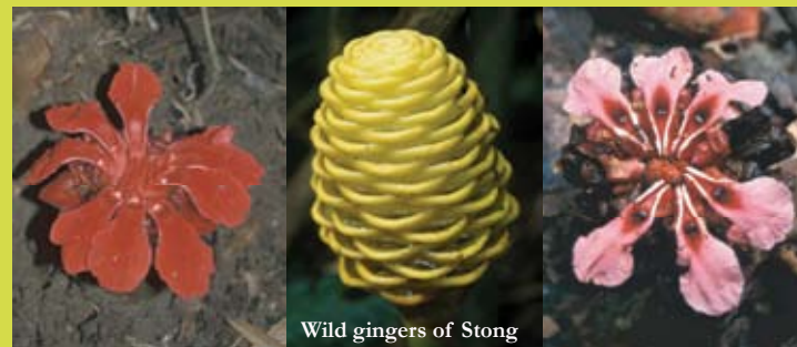
Wild gingers of Stong