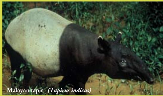
Malayan tapir ( Tapirus indicus )

Gunung Stong State Park is a destination that has a variety of attractions that would appeal to both nature-lovers and adventure seekers alike.