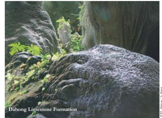
Dabong Limestone Formation

Gunung Ayam, the highest peak in the area, standing at 1,504m is the ideal spot to watch both sunset and sunrise. A campsite is available for overnight stays.